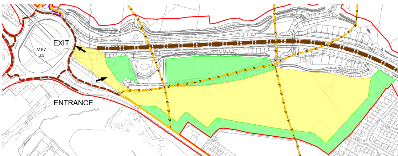
Figure 2.2: Site Compound (extract from 2.8 Temporary Works Plan)